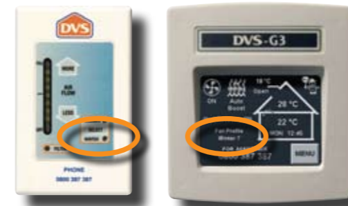
Left: DVS® G3®

All climate-controlled models (such as DVS® 1, 5 and 5E) should be set to 'Winter' mode or, if you have a DVS® G3®, change the fan profile setting to 'Winter 7' (see your Operating Guide for full instructions on how to do this). This ensures that the fan will speed up when the air in your roof space is warm, bringing more of that warm air into your home when you need it most.